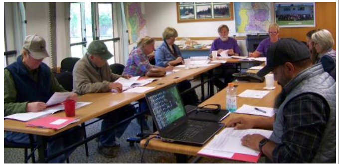
At their September 2019 Annual Meeting, MLS Board Members and CLWG Co-chairs review the 2019 Breeding season and discuss 2020 needs.