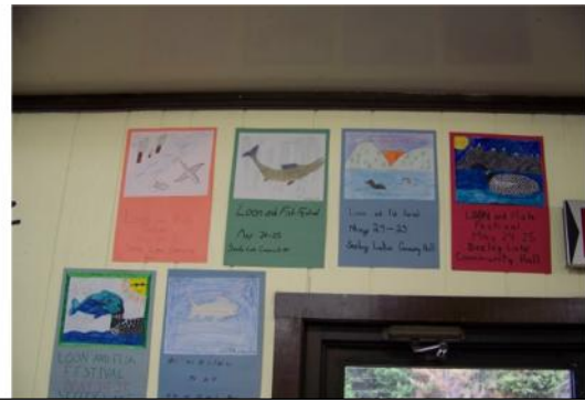
Design posters to place around your school or community to announce your event or educate the needs of loons.