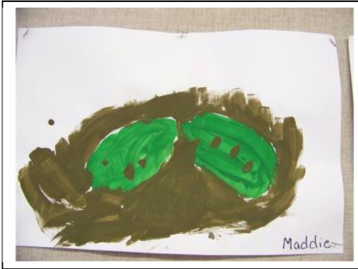
Loon nest with 2 eggs.