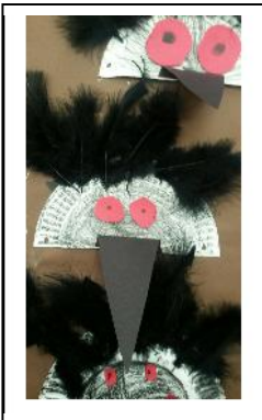
Make a loon costume with head dress and wings to wear on your arms. (To wear wings add loops out of cardboard to put your arms through.)