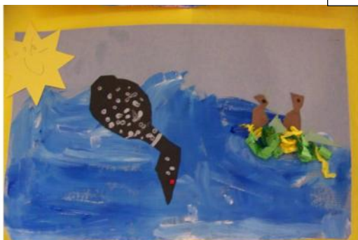
Loons in action. Paint loons and chicks to cut out and glue on swirly painted water. Add tissue paper nest.